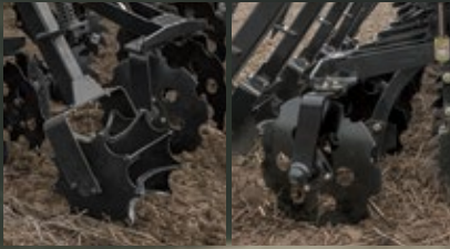
▲ Berm Condition'r ▲ Berm Build'r